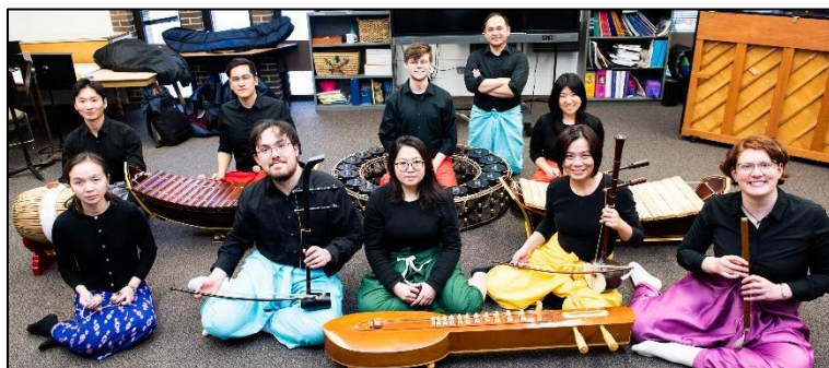
The NIU Thai Music Ensemble will perform at the Nov. 5 Showcase of SEA Performing Arts.