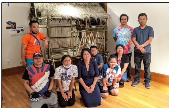
Some of the members of the Karen community in Aurora, IL with a traditional bamboo house they recreated for "The Art of Surviving" exhibit.