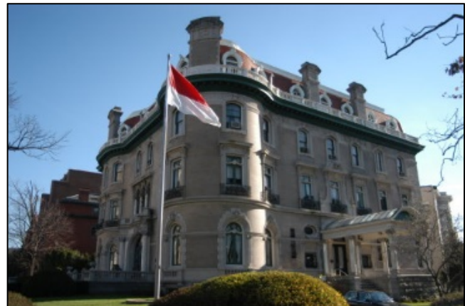
The Indonesian Embassy in Washington, D.C.