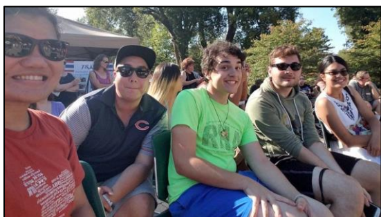
First-year Thai students, above, enjoy a Thai Fest performance, right, at Olbrich Botanical Gardens in Madison, Wis.