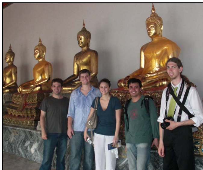
Study Abroad Thailand 2011

Examine NGOs in Cambodia, Thailand and Vietnam. Explore cultural diversity in Thailand. Experience Balinese music, dance and culture in Indonesia. Learn Lao language and culture in Laos. Conduct clinical research on hearing loss in Cambodia or environmental research on public health in Indonesia. There are more choices than ever to study abroad in Southeast Asia next summer. NIU faculty will lead five of six study abroad programs to SEA offered through NIU's Study Abroad Office.