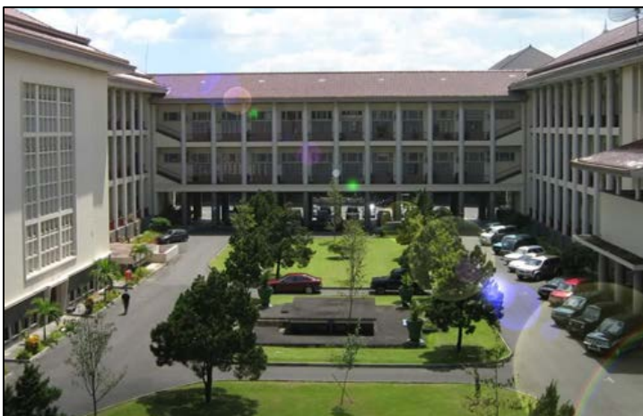
Gadjah Mada University campus

The June 24–July 7 program, Democracy and Cultural Diversity in Indonesia , will focus on Indonesian politics, religious and ethnic diversity and conflict in a rapidly changing Southeast Asian society. Yogyakarta is a vibrant hub