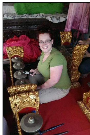
Learn about Balinese music, dance, theatre and craft in Jui-Ching Wang's summer study abroad program in July.