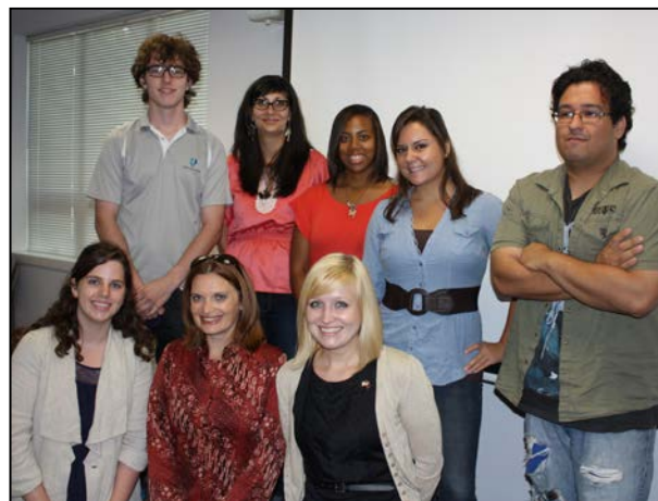
Some of the summer 2012 FLAS fellows share their experiences at the weekly CSEAS lecture series last fall.