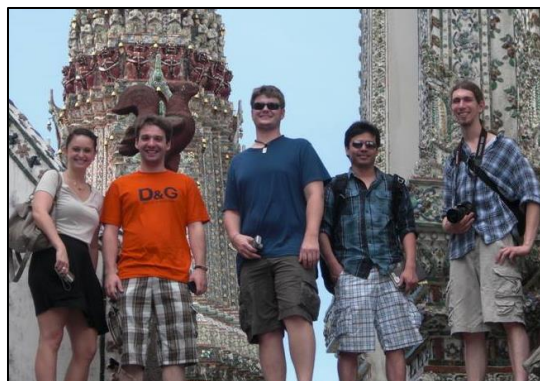
NIU Study Abroad in Thailand, 2011