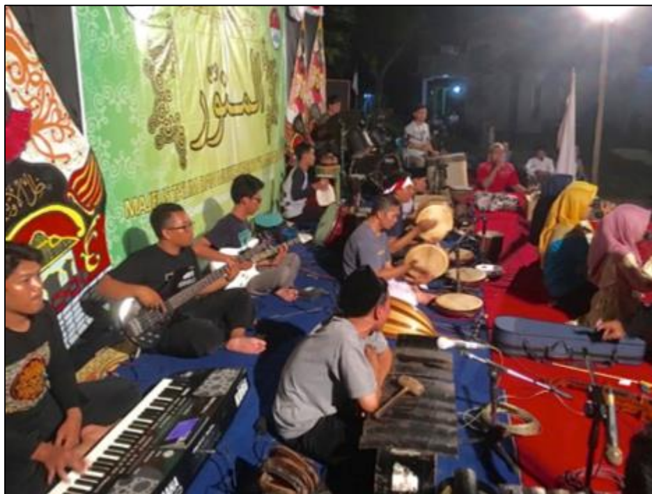
Sound check for Al-Mizan during a concert in Bantul, Yogyakarta. Learn more about Islam's role in modern Indonesian sociocultural practices in this week's lecture.

Center for Southeast Asian Studies at Northern Illinois University • Week of February 20, 2017