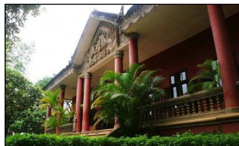
Center for Khmer Studies, Siem Reap