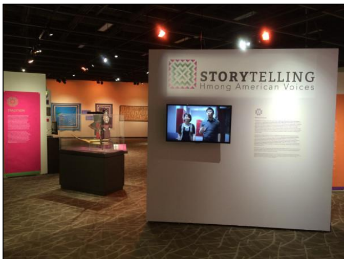
Storytelling: Hmong American Voices officially opens this weekend at the Pick Museum of Anthropology.