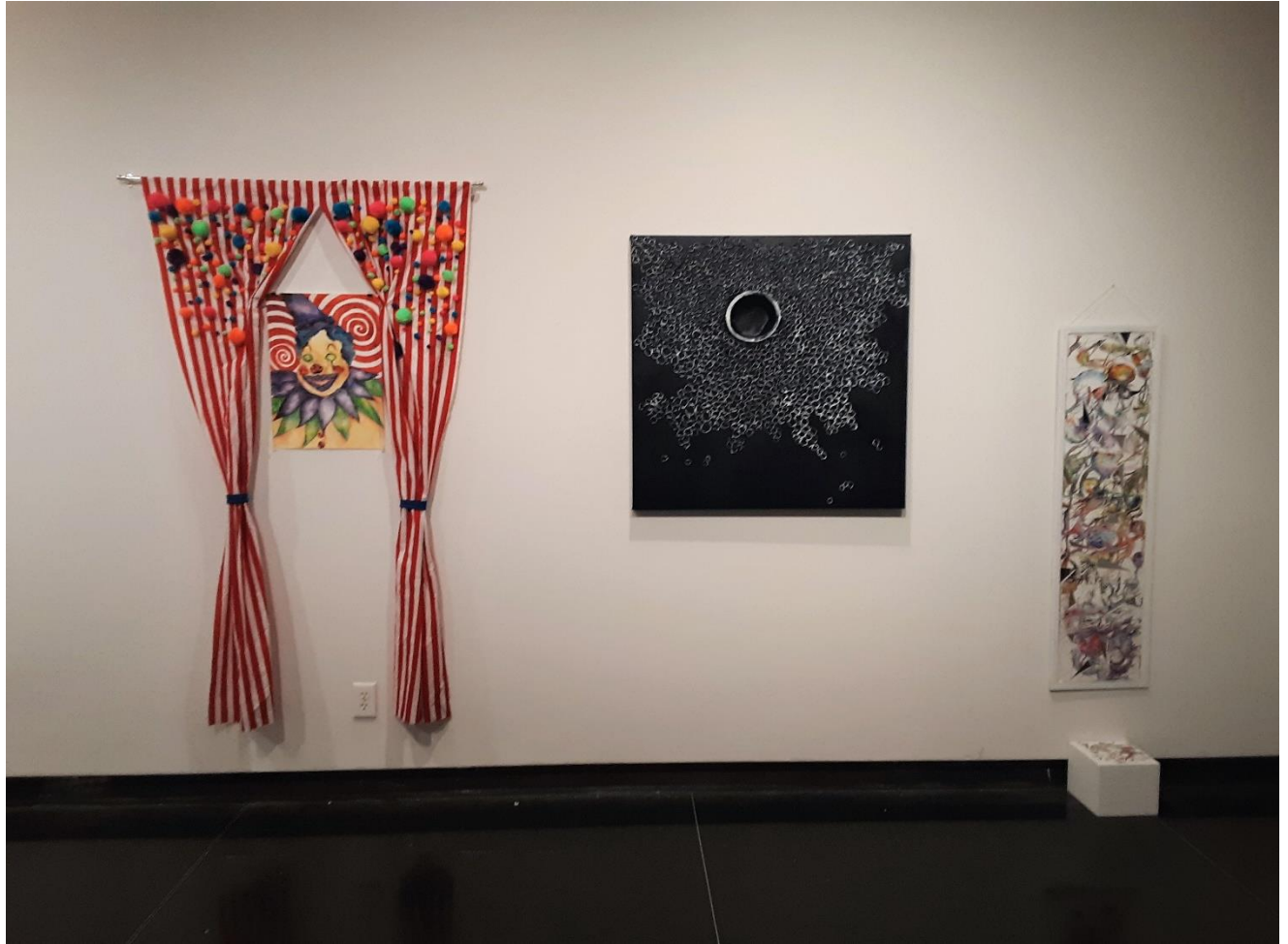
1. Installation View