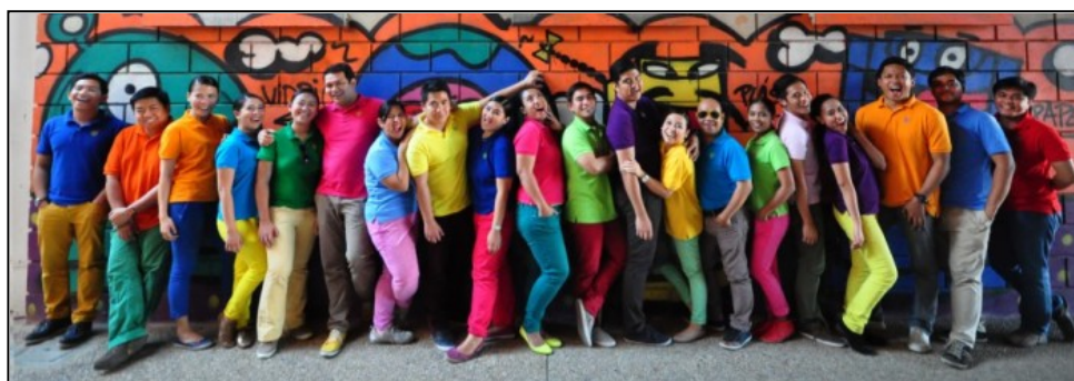
Philippine Madrigal Singers

The Philippine Madrigal Singers from the University of the Philippines will perform from 7 to 8 p.m. Sunday, April 28, in Boutell Memorial Concert Hall. The award-winning