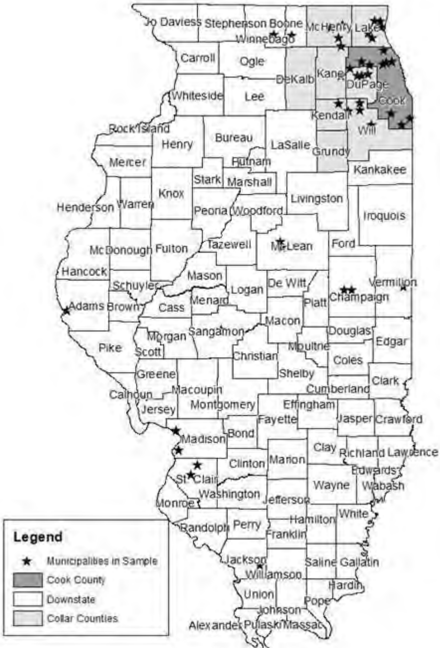
FIGURE 1 LOCATIONS OF SAMPLE MUNICIPALITIES